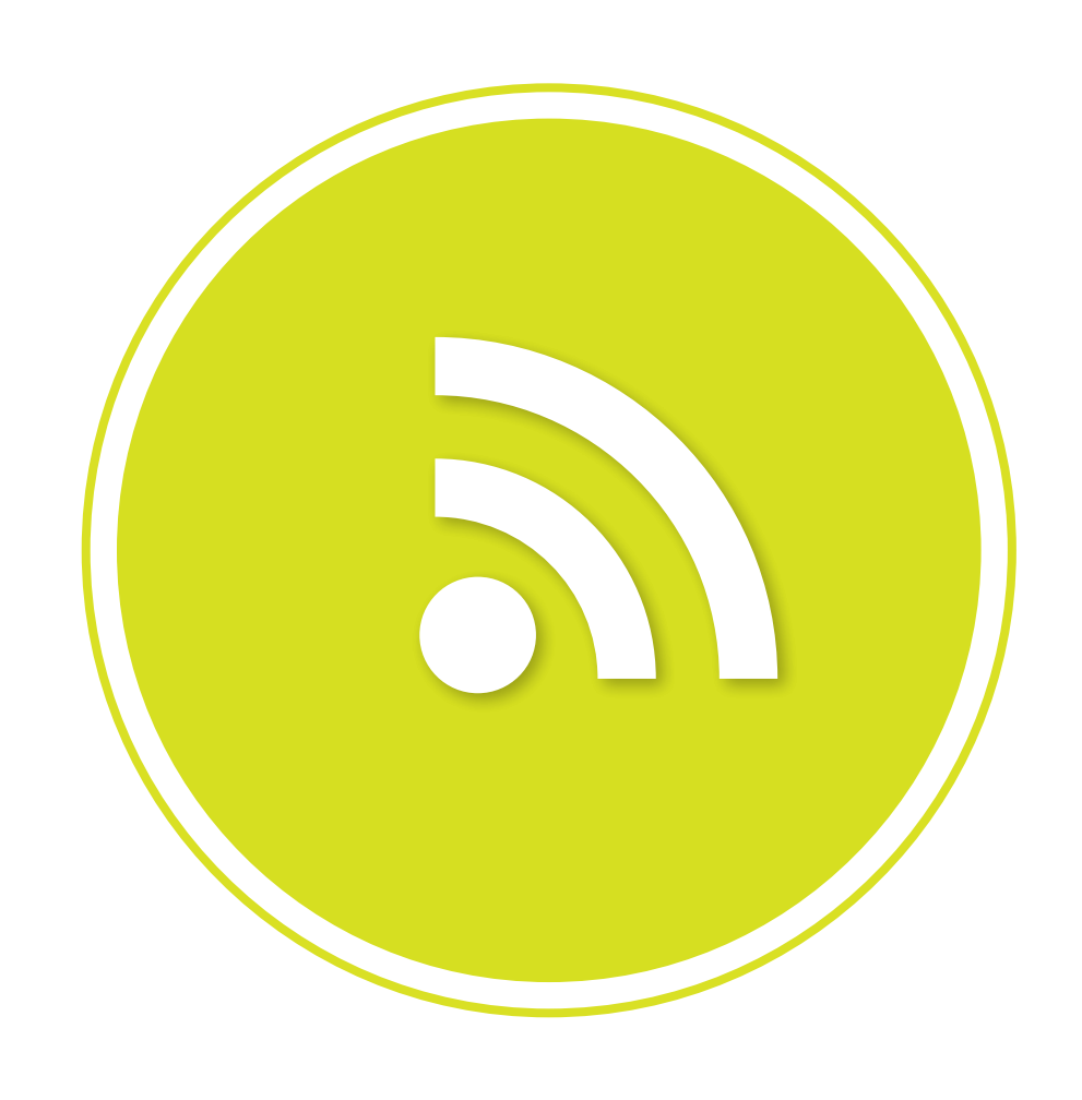
Publication & disclosure of contracting data (not just contracts!)